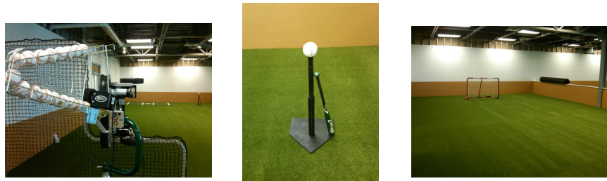
Batting Cages and Soccer Zone (space as available)