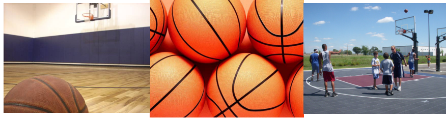
Indoor & Outdoor Basketball Courts – (Indoor closed during judging)